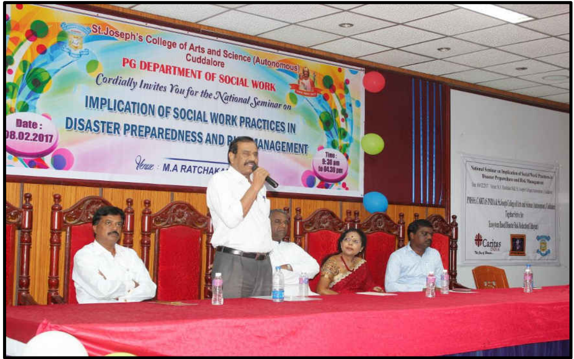
(Panel Discussion by the Dignitaries)