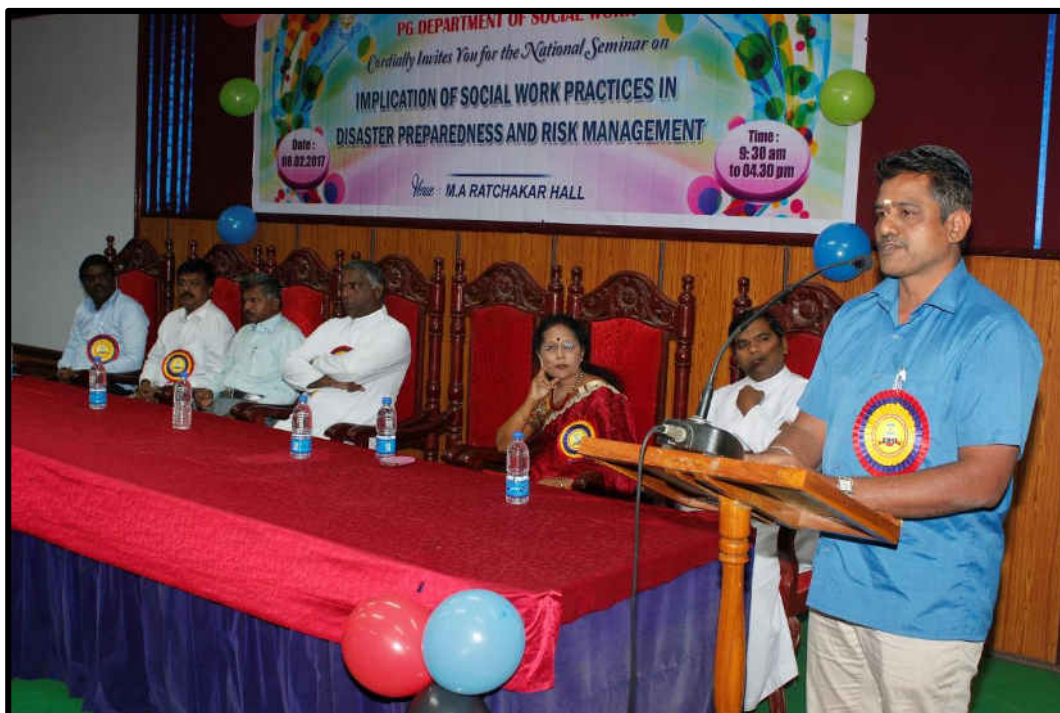
(Inspring speech by Chief Guest)