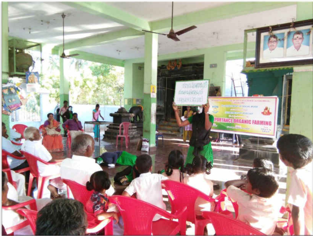
(Street Play about the Importance of Agriculture by MSW Students)