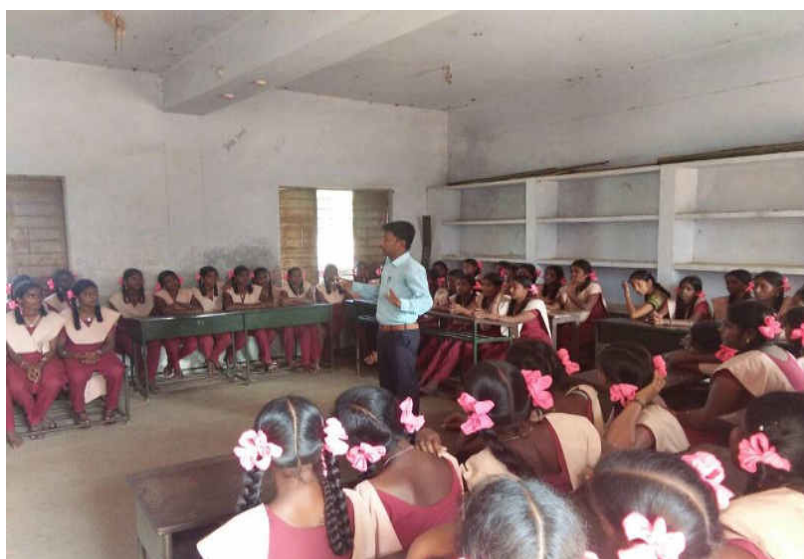
Chief guest's interaction with the students