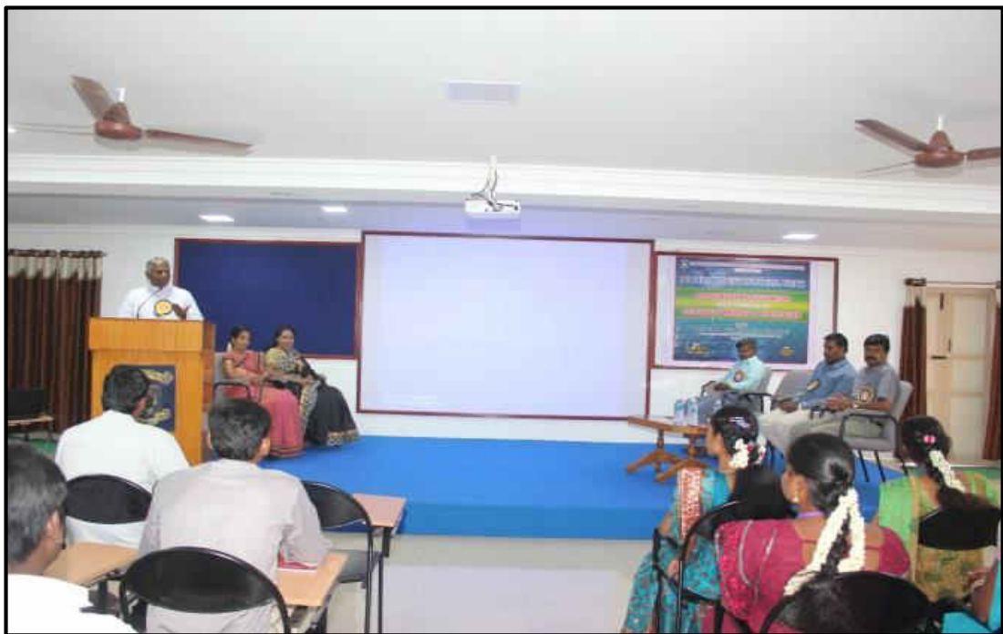
(Encouraging words by Secretary at the Association Inauguration)