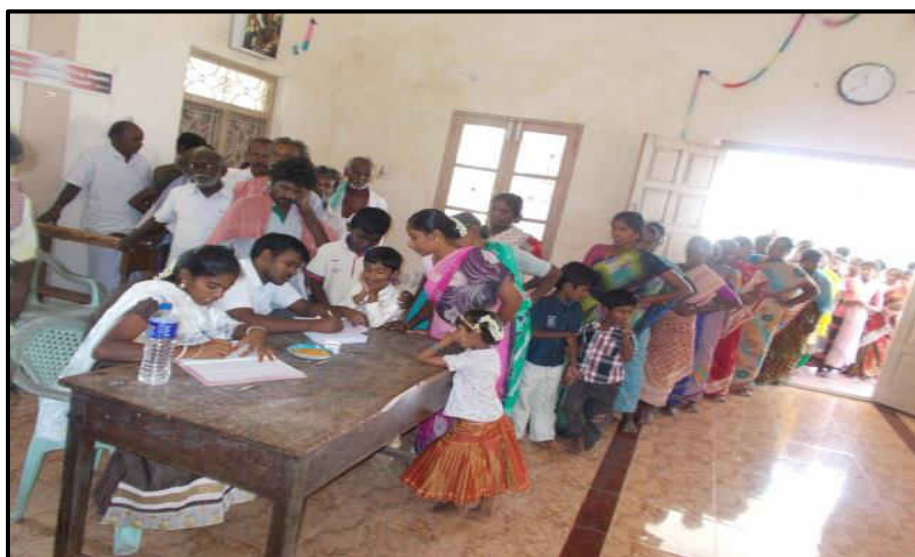
Registration process during Free Medical Camp.