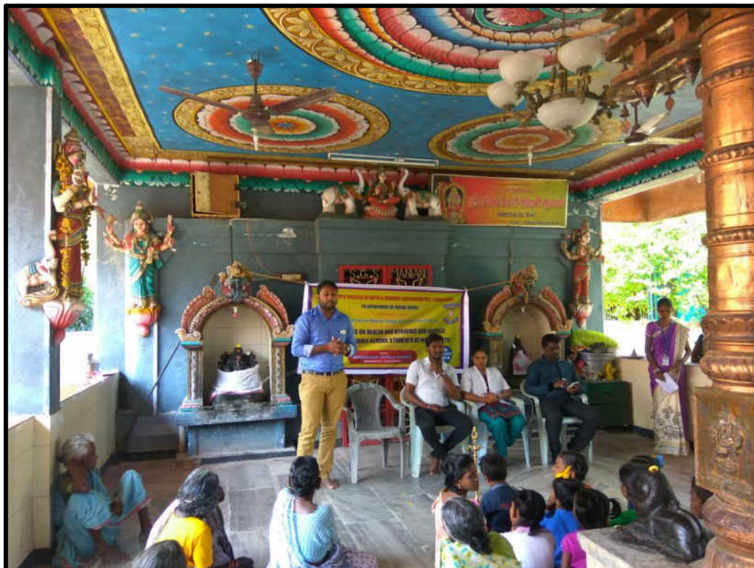
(Inspiring speech by the Chief Guest)