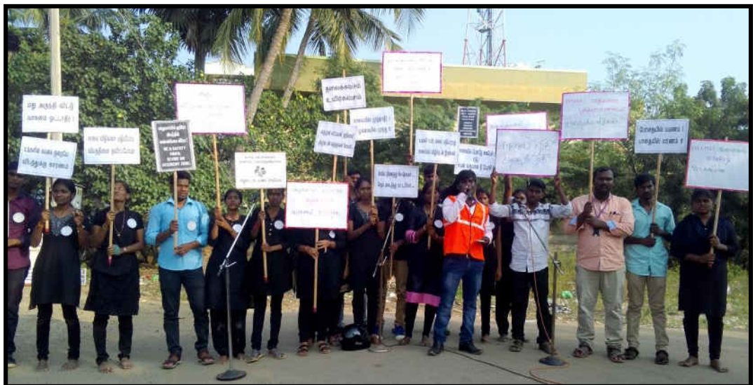
(Street play on Road Safety by the students)

The PG Department of Social Work in collaboration with Godrej Consumer Products Limited, Pondicherry organized a street play on road safety on 12.01.2017. The students of social work performed street play on Road Safety to the villagers of Kattukuppam, Pondicherry and the labourers of Godrej Consumer Products Limited, Pondicherry. The street play focused on the safe driving on the roads and healthy practices for road safety. The students used the songs, captions, placards to give awareness about road safety. People who were using helmets, seat belts and follow the rules were identified on the spot and were awarded with prizes.