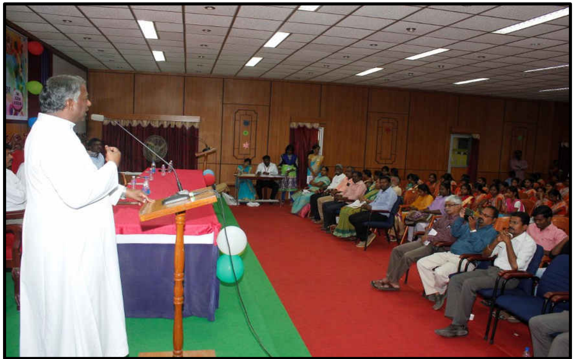
(Valediction speech by Secretary)