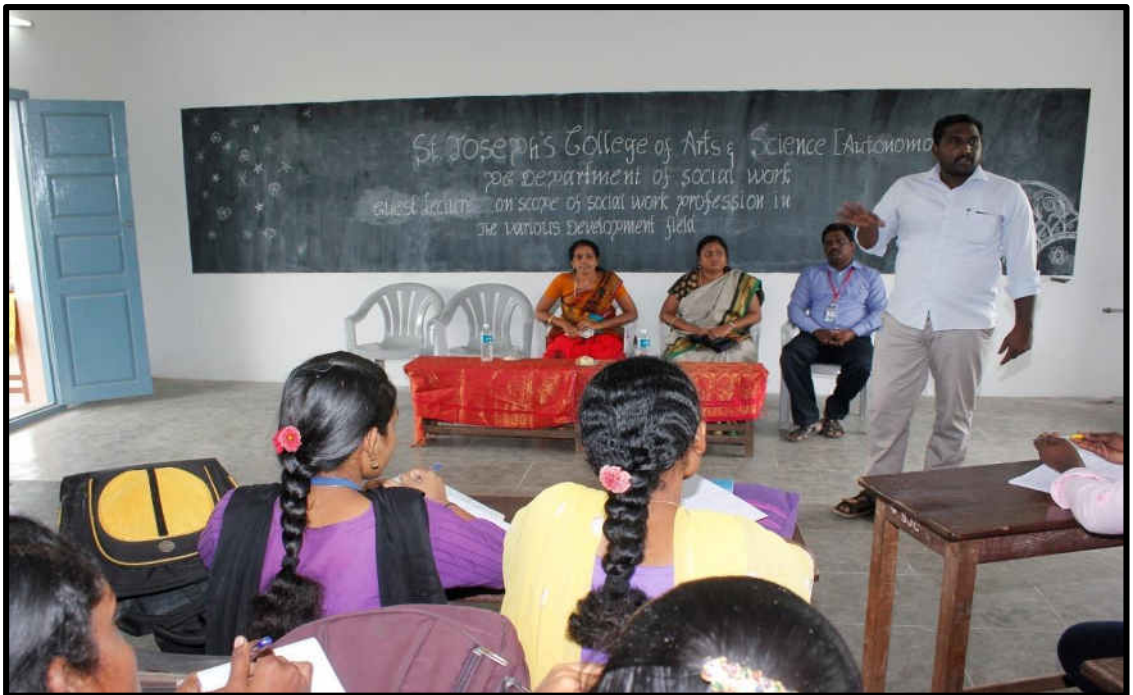
Chief Guest inspiring the gathering