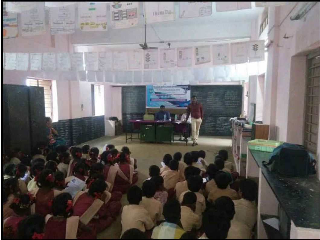
(Chief Guest is inspiring the gathering)

Institute, Pondicherry was the Chief Guest. He explained about mental health and child psychiatric problem, behaviour problem, problem at home and student's low performance in school due to mental health problem was discussed. He also explained the various mental health problems to the teacher and asked them to contact the hospital when anyone needs help. The students performed dance and the programme concluded with national anthem.