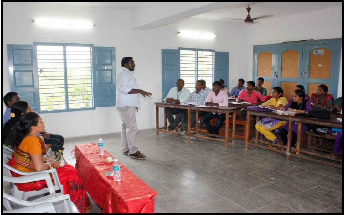
Motivating speech of Chief Guest