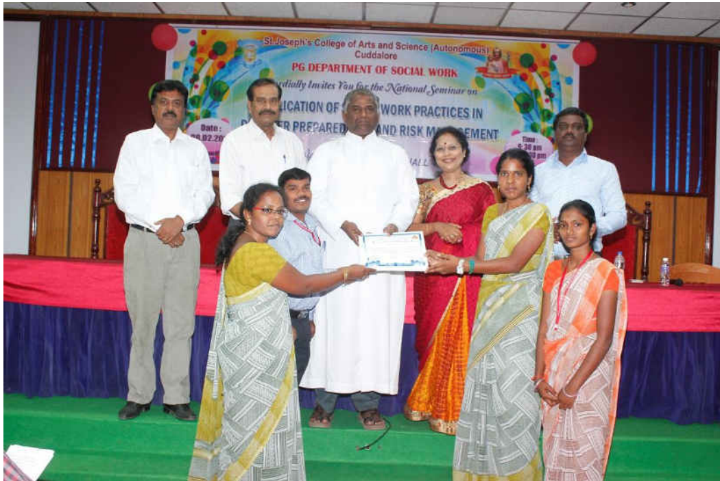
(Certificates distribution by Rev. Fr Secretary)