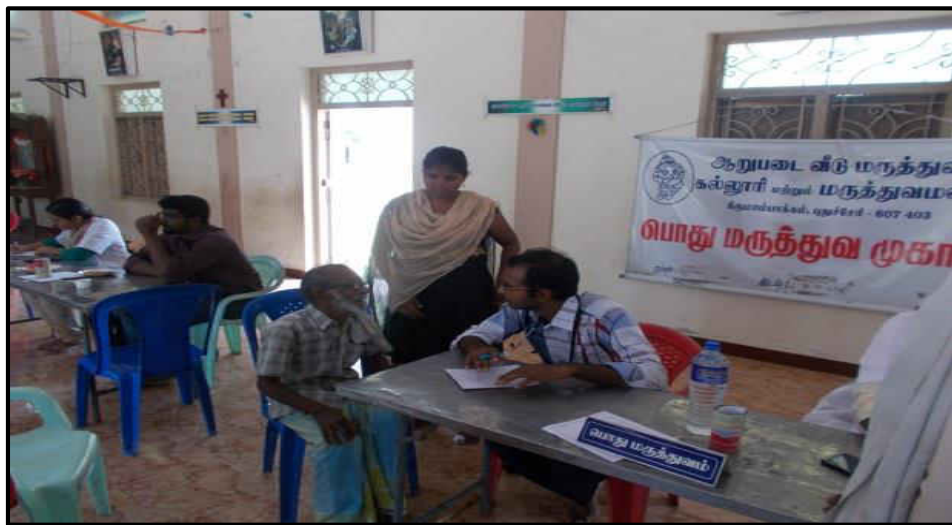
Diagnosing the patient by the patient at Medical Camp