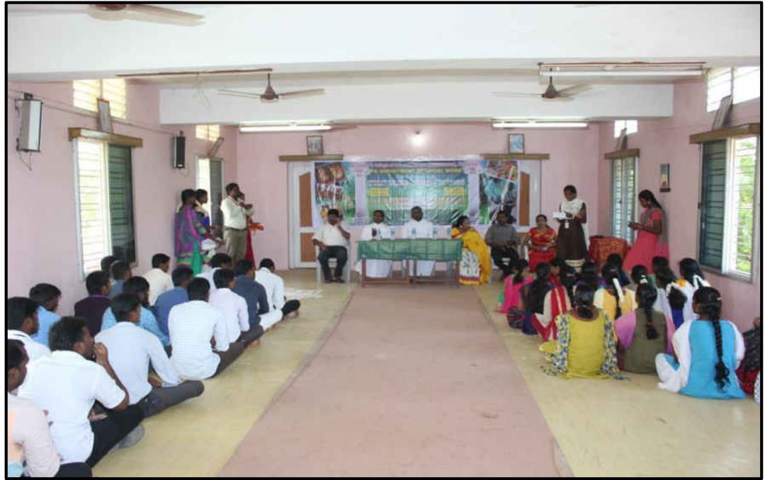
Inaugural Ceremony of Street Theatre Training Programme