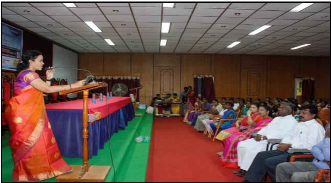
Chief Guestenlightening the participants