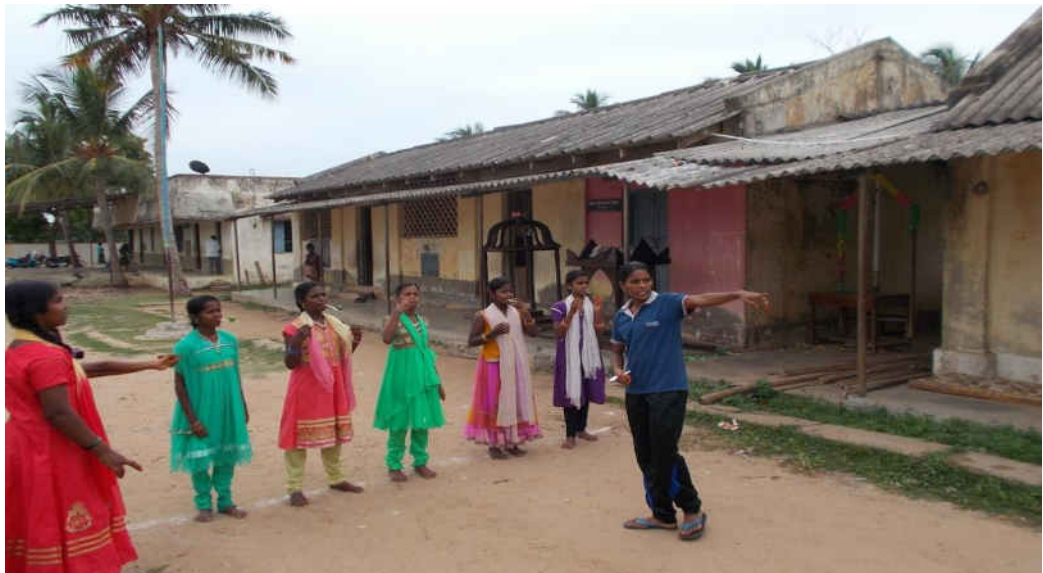
Sports Day activity on 17.09.2016 during rural camp at Siluvaipuram.