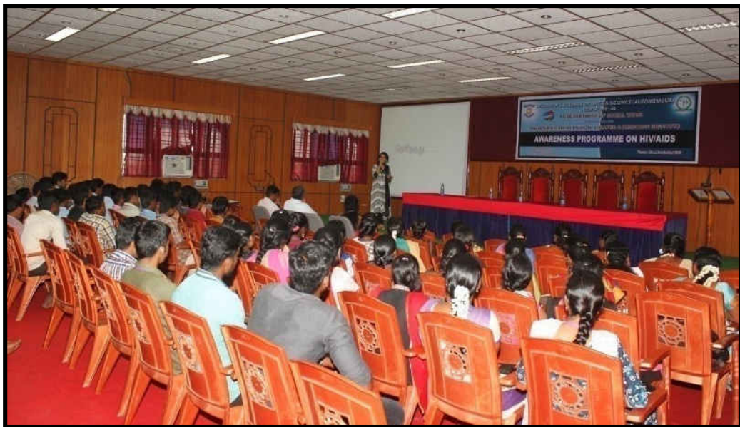
(Motivating speech by the Chief Guest)